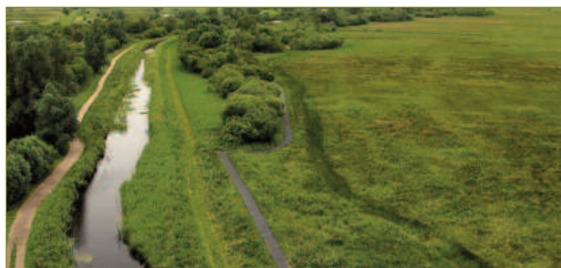
The unique ecosystems of Wicken's Sedge Fen will be protected with a new water management system.

A major project has begun to help conserve the unique fenland flora of Wicken's ancient Sedge Fen.