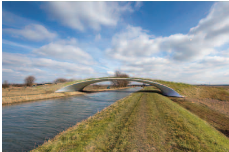
Artist's impression of the new bridge over Burwell Lode. Wicken Fen Vision staff are keen to hear local views about the proposed bridge.

Plans for a new multi-user bridge over Burwell Lode, the vital last element of the Lodes Way have been unveiled.